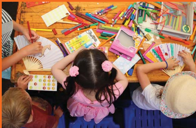
Bryan Brown Theatre

Greenacre Library and Knowledge Centre Friday 7 October