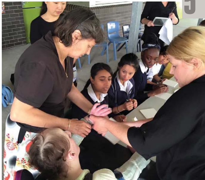
Year 11 students from Bankstown Girls High School help Caroline Chisholm Special School students make tile art for the new playground.

Work is expected to start later this year and be completed mid next year.