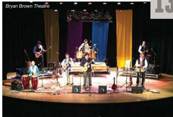
Bryan Brown Theatre

Help try and solve any mysteries in your family history by calling 9707 9728 or 9789 9416 .