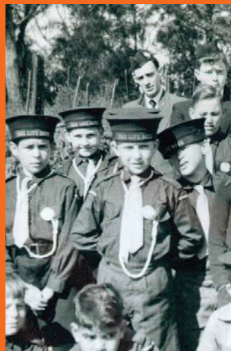
Padstow Life Boys at Medlow Bath station 1963.

If you have any items that you would like to donate or allow us to copy call 9707 9728 .