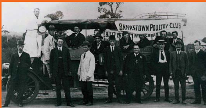
Bankstown Poultry Club c1920s.