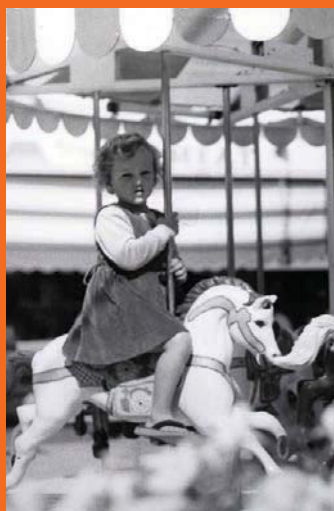
Celebrating the Old Town Centre 1978.